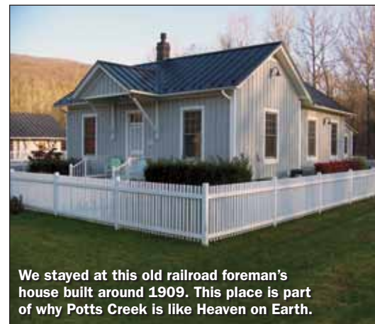
We stayed at this old railroad foreman's house built around 1909. This place is part of why Potts Creek is like Heaven on Earth.

The doe and her fawns kept me entertained for a few minutes, and then they left. A few minutes later, three more does