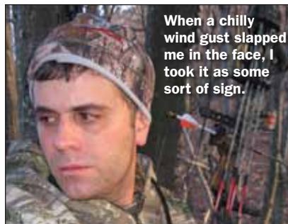
When a chilly wind gust slapped me in the face, I took it as some sort of sign.